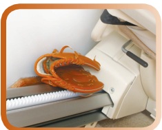
Safety sensors on carriage and footrest stop the lift instantly at obstacles.